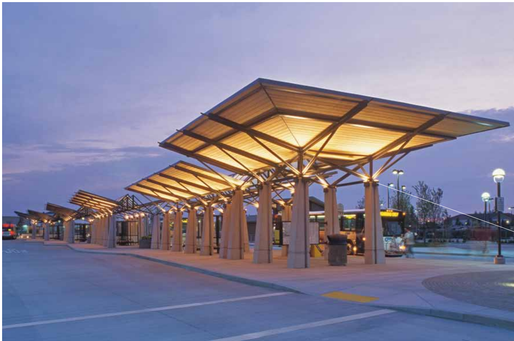
Style M452 with custom perforated visor uplighting canopy

Architect: Waterleaf Architecture, Interiors & Planning Lighting Design: Luma Lighting Design Engineer: PAE Consulting Engineers