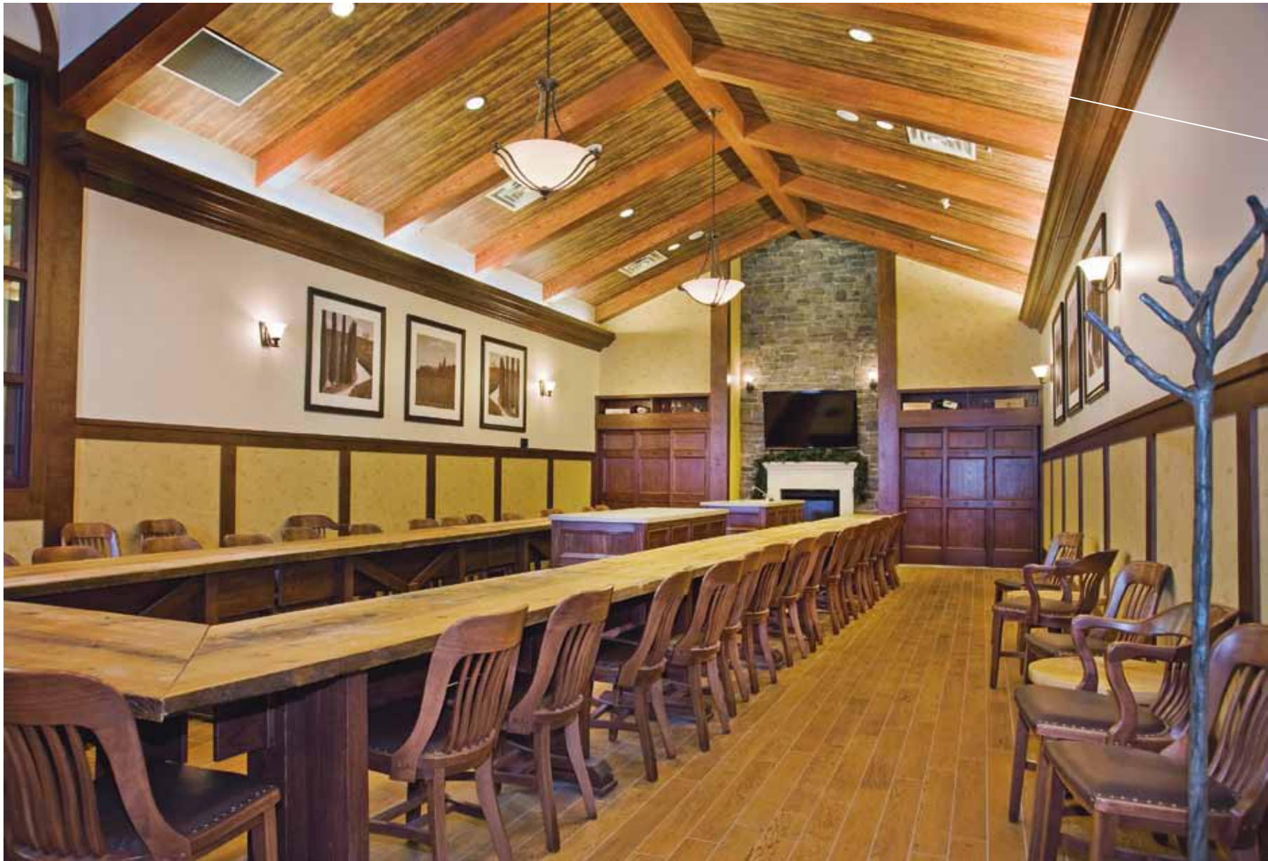
Style F307 in coves

Architect: BCW Architects Store Design: King Retail Solutions Engineer: MP&P Engineering