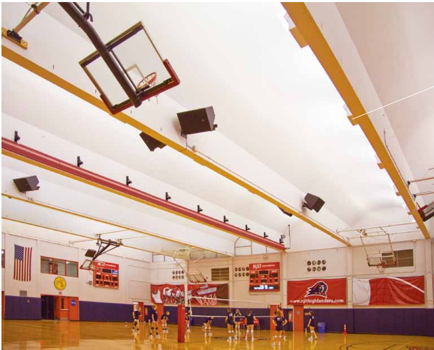
Style M417 XL

Architect: ikon 5 Architects Engineer: Bard, Rao + Athanas Consulting Engineers