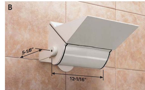
Style M152-0175-V-02-B-V00 (quantity 8)

Built to last, the Style M152 features all aluminum and stainless steel components, precured silicone gaskets, a tempered glass lens and tamper resistant door screws. Electrostatically applied thermoset polyester powder coat finish on the M152 exceeds 1000 hour exposure (ASTM B117-90 Salt Spray [Fog] test).