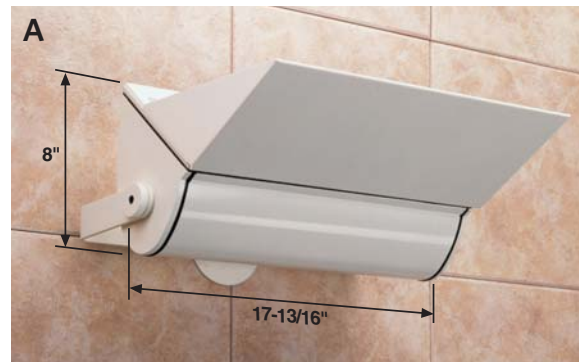
Style M152-0400-V-02-B-V00 (quantity 12)

Estimated initial footcandle values along column line with 50/0/20 reflectances.