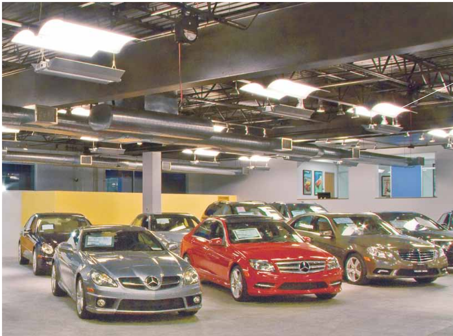
Style F124 modified