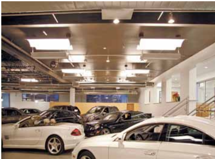
The gullwing pendants are organized between locations of direct track lighting (by others).

The Lighting Quotient's Customs Department stands ready to take a concept from drawing to fabrication and to fit the parts to our luminaires for an integrated design solution.