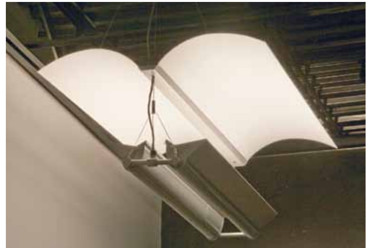
A matte powder paint finish on the custom gullwings enhances the perception of a soft, uniform glow.

Cradle to Cradle Certified™ is a certification mark licensed by the Cradle to Cradle Products Innovation Institute.