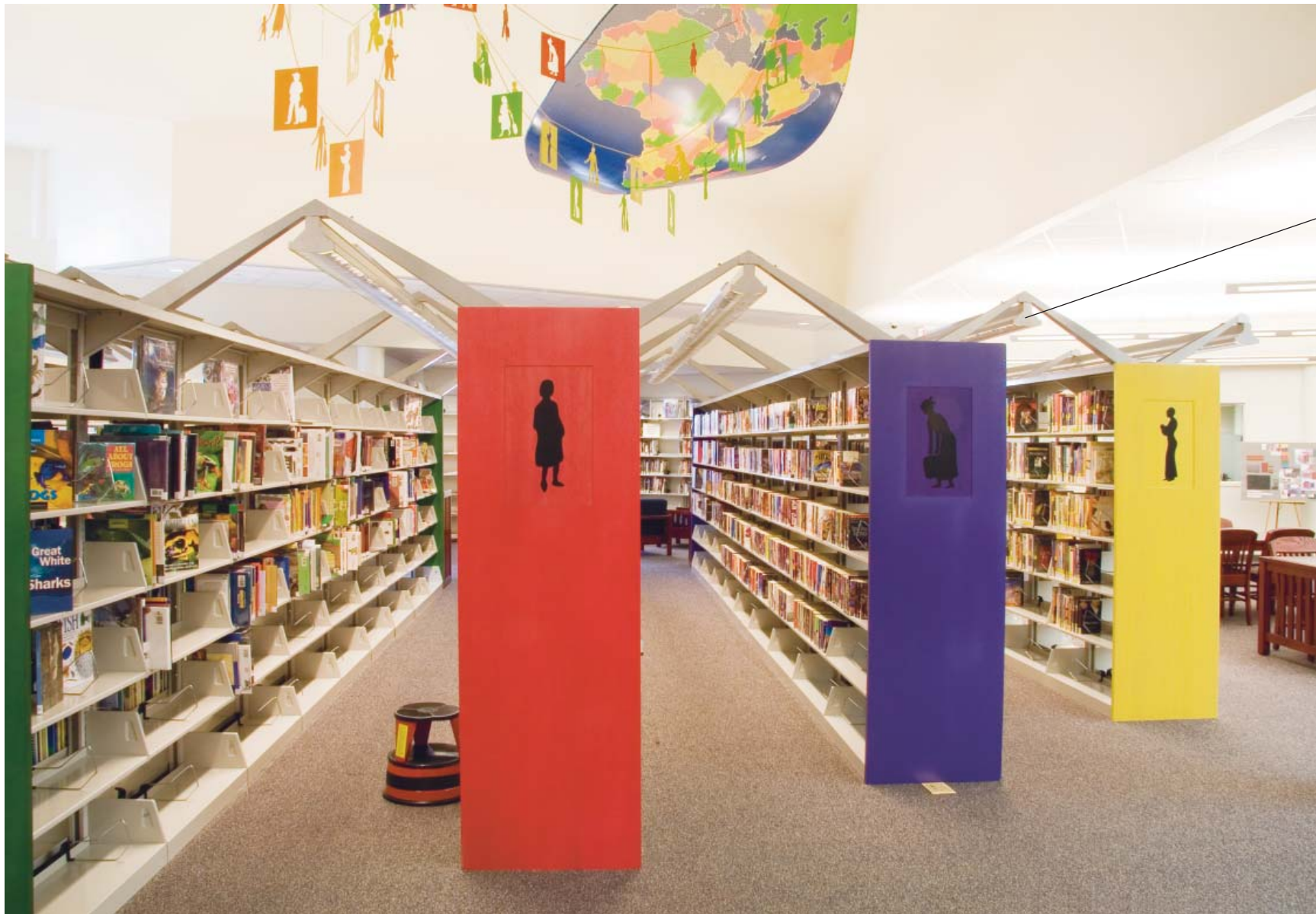
Style 3030 Stacklight