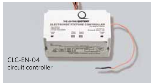
CLC-EN-04 circuit controller

Controls by The Lighting Quotient follow the EnOcean Alliance wireless protocol, the international standard for sustainable buildings. The CLC-EN-04 circuit controller serves both as power supply for 24V motion sensors and switching relay for lighting and plug-load circuits. An onboard EnOcean radio allows it to communicate with a wide variety of EnOcean-enabled devices to create extensive, easily deployed wireless control networks.