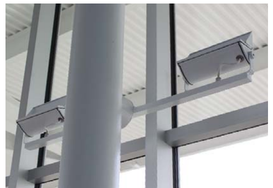
Architect: Weiss/Manfredi Architecture/ Landscape/Urbanism Lighting Design: Brandston Partnership, Inc.